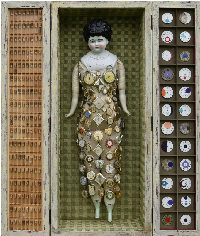
Carlos Estevez. Timekeeper , 2020. Assemblage, 32 3/4 x 28 1/4 x 5 1/2 in.